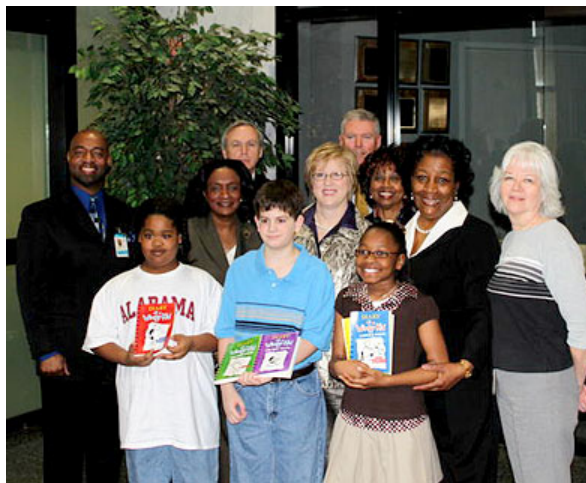
'Donated by AT&T Pioneers' labels in each book.

Book Fair credit vouchers are given to each school's librarian/media specialist to choose new books that meet their specific school library's needs. School librarians are allowed shop at the book fair warehouse for new book. Once the school representative has selected their designated amount of books, the warehouse staff ships all books to AT&T Pioneers. The AT&T then place 'Donated by AT&T Pioneers' labels in each book.